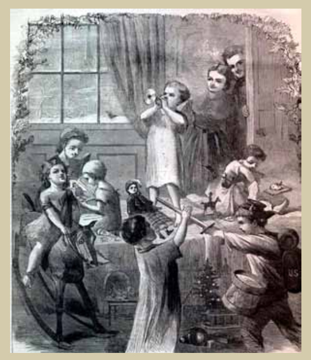
This drawing from a December 1863 issue of Harper's Weekly shows children in a northern family enjoying new Christmas presents, including dolls, books, a rocking horse and other assorted toys. Emphasizing the war, one boy wears a kepi, haversack and drum while wielding his toy sword.

As the holiday neared in 1862, the young students of a woman – who happened to be the wife of a Confederate general – who taught dance in Winchester, Virginia, collected among themselves three dollars to give their teacher a Christmas present. They wanted to give her much-needed sugar, coffee, and tea, but no local merchants could provide these things. Because Union troops occupied Winchester at that time, the girls went to the Union camp but were told the army was prohibited from selling supplies to local people for fear the food might end up with Confederate troops. The girls then told the sentry they were on "important business" and asked to see the officer in charge of the encampment. "You can hardly imagine a more scared set of little girls," one recalled years later, as they were taken to see the Union colonel. They ex-